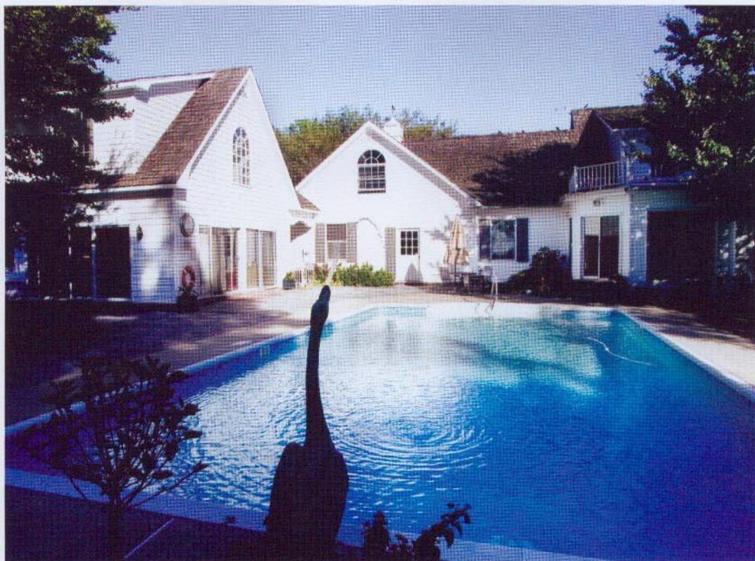
A weekend with a view: The private guesthouse comes complete with riverside pool and patio, encircled by flower beds and a picket fence.

A group of old girlfriends settle in for a relaxing overnight at Easton's Miles River Guest House.